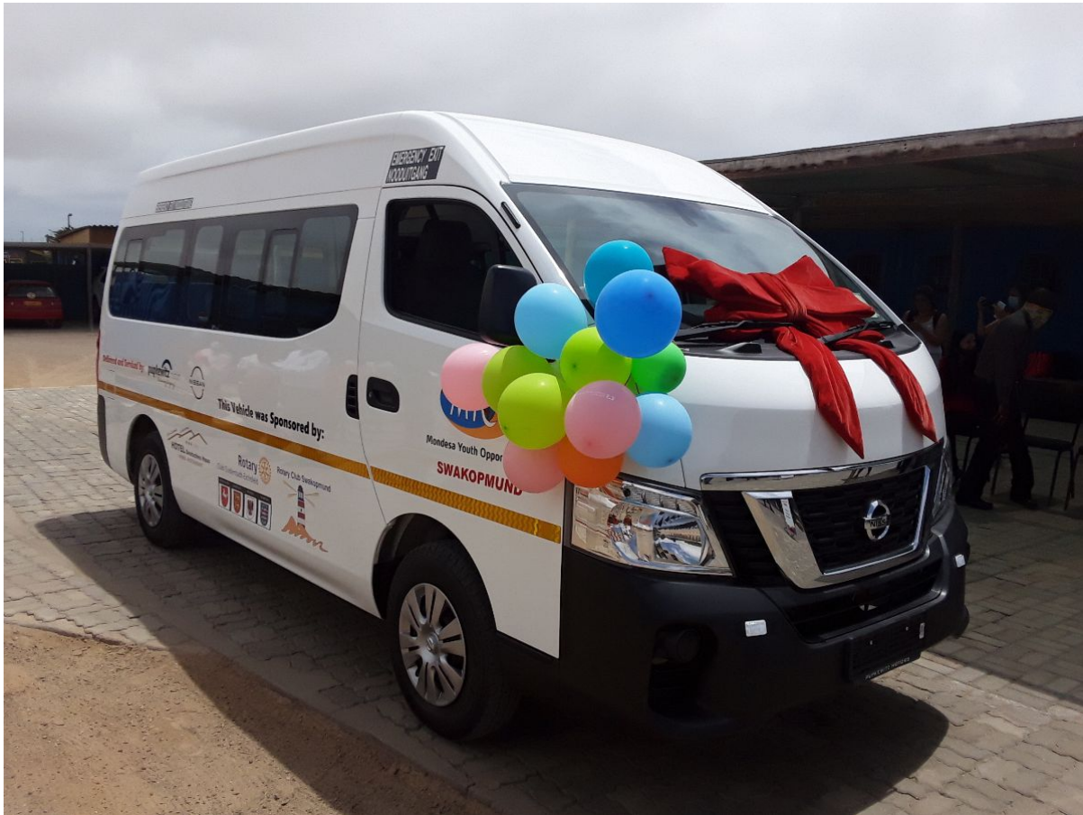
MYO's Rotary sponsored combi.